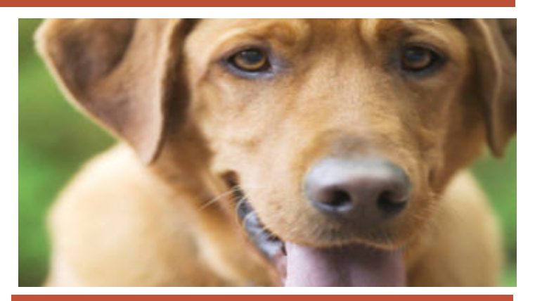
Neighbor to Neighbor Dogs in Park West: Residents' Comments

Park West Annual Meeting November 15 - 7 p.m. Robinson Secondary Cafeteria