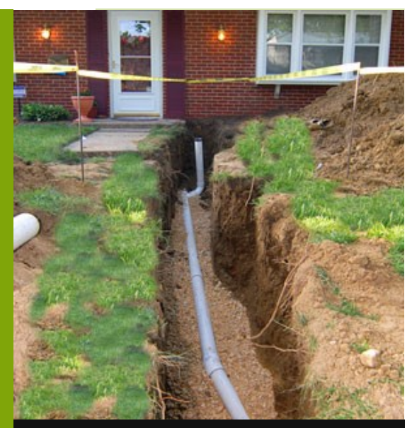
Sewer and Water line repairs can be costly!

Our homes are 30+ years old with the usual issues that arise from that age. You as the homeowner are responsible for your lines off the main pipes - they are known as 'laterals' and are typically in your front yards. These sewer and water laterals have gone through the repeated freeze/thaw cycles and an earthquake or two. Consider an add-on protection program to cover these repairs - or risk finding out the cost after the problem occurs. One company the HOA is aware of that provides such coverage in our area is <a href="https://www.dominionenergy.com">www.dominionenergy.com</a>.